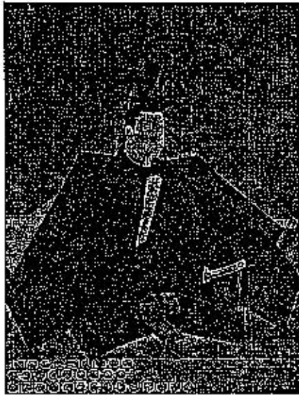
Minamoto Yoritomo (1147-1199 AD)