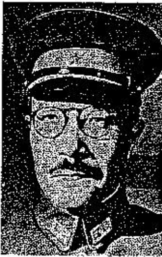
Tojo Hideki (1884 - 1948 AD)

President John Quincy Adams remarked as he left office about how the Republicans had triumphed and displaced the Federalists - We have conquered the enemy. We have occupied their hill. We have become the enemy.