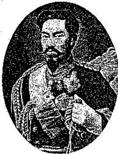
Meiji Tenno (1852 - 1912 AD)

the very destruction of the Tokugawa Shogunate by 1867. When the Tokugawa Shogunate could no longer keep the European and American traders away, its support among the people simply just imploded. People wanted trade. They wanted new ideas and new products. They craved change and progress itself.