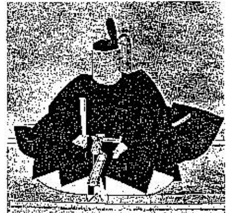
Tokugawa Ieyasu (1543-1616 AD)

In March of 1999, I delivered a major forecast in Tokyo that to the Japanese was earth-shattering. I dared to warn that the unbeatable LDP (Liberal Democratic Party) was entering a downward spiral from which it would lose power. Forget the markets. What I publicly forecast was like attacking God himself. There were literally gasps I heard in the audience.