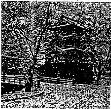
Hirotsuki Castle - Japan

The Japanese people have been oppressed for so long, what is starting to emerge is a new and vibrant culture. The turning point was truly 1976. After that date, we begin to see the rise in Japanese corporate power and trade. By the mid 1980's, the Japanese have purchased about 33% of the entire US National Debt in an effort directed by the LDP to ease trade friction. The Japanese emerge from the centuries of being isolationists, into the full member status of the global economy.