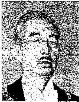
Hirohito (1901 - 1989 AD)

people in a radio broadcast on August 15th, 1945, that Japan would accept the Allies' terms of surrender.