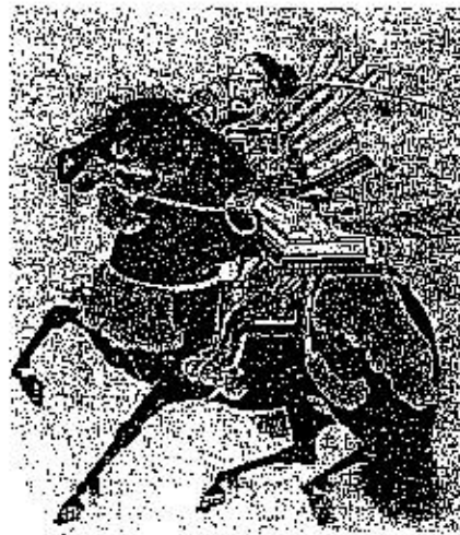
Ashikaga Tadayoshi (1306-1352 AD)