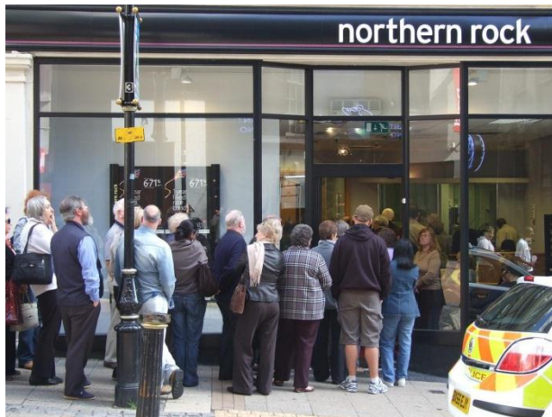
created a "run" on the bank.

The banks BORROW short-term on a DEMAND basis and lend the money out long-term such as mortgages. During a crisis, if more people than the 6% wanted their money, the bank failed and thus