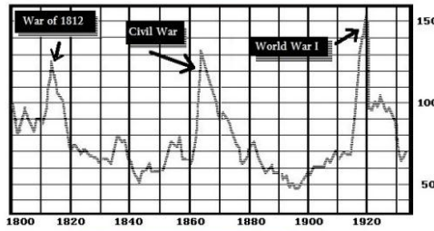
The three great commodity waves used by Kondratieff COPYRIGHT MARTIN A. ARMSTRONG ALL RIGHTS RESERVED