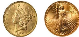
US $20 Gold 1949-1932

Those who think somehow that a gold standard will miraculously solve all our problems live in some fantasy world of pure fiction. While it is true that the $20 gold coin issued in 1849 through 1933 for 84 years remained the same fineness and weight producing the image that there was some sort of gold standard that worked, need to look at history.