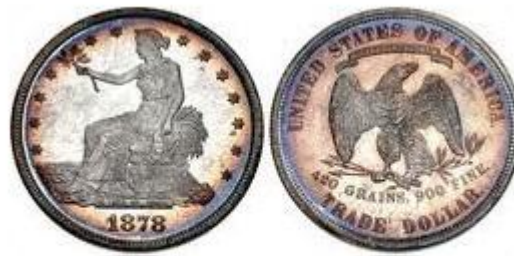
US Trade Dollars 1873 - 1878 420 grains (trade) v 412.5 grains (domestic)

international Trade Dollar minted at 420 grains of silver compared to domestic silver dollars at 412.5 grains. These Trade dollars facilitated trade with Mexico and China and the coins had to weigh the same as foreigners used or else the dollar would not be acceptable in payment except at a discount.