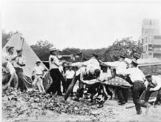
Bonus Army 1932

The key to understanding the world is that capital flows like water to the lowest spot but in finance it is the lowest risk and right now that is the dollar. Here are the illustrations of capital flows for the Great Depression and the 1987 Crash focused on Japan. Note that the capital inflows peaked in 1927 when the Fed cut US rates trying to deflect capital back to Europe. The capital outflow peaked in 1931 with the Sovereign Debt Default . The capital flows switched back to a positive inflow AFTER the Roosevelt devaluation of the dollar in 1934 and the threat of war was building. Looking at Japan-US capital flows, we can see how highly volatile they became going into 1987 and the fears then also of a further dollar devaluation of 40% imposed by G5 market manipulations. If you ignore global BIG money and understanding how it moves differently, you are asking to be slaughtered.