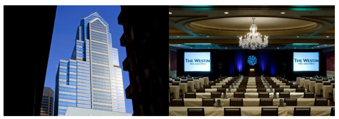
99 South 17th Street at Liberty Place

Philadelphia, Pennsylvania 19103 Phone: (215) 563-1600