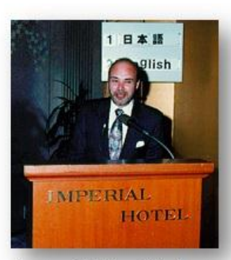
Imperial Hotel Tokyo

This Analytical Conference will provide real world analytical tools for making your own trading and major strategic investment decisions. This will include technical analysis that is cyclical based and by far not the normal uptrend, downtrend charting techniques. This will include