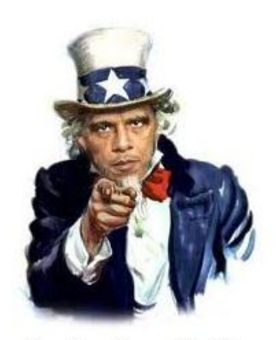
I'm Coming 4 U - MF

Americans do not realize it but everything for which the Revolution was fought has been taken away. What about the "no taxation without representation!" Historically, a king could not tax the people except in time of war WITHOUT THEIR CONSENT! America revolted against monarchy because you were the PROPERTY of the king. If you were British and killed someone in Paris, the French king did not punish