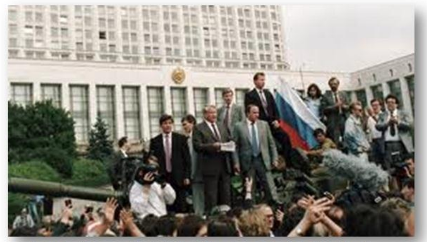
August 19th, 1991 - Borris Yeltsin Stands on a Tank to Stop the Coup