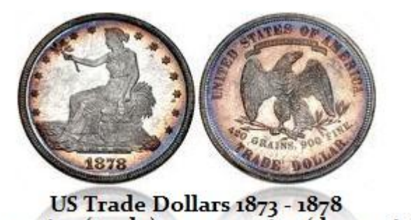
420 grains (trade) v 412.5 grains (domestic)

Other than this brief issue, Americans are traditionally ignorant of monetary systems other than the dollar and nothing else. This has been caused by the distinct difference between