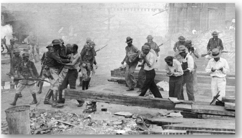
Bonus Army - Summer of 1932