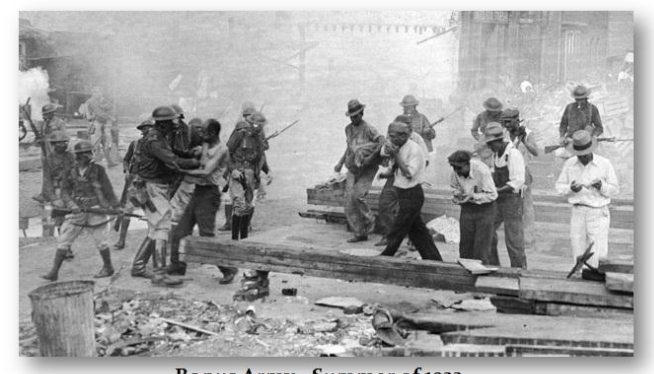
Bonus Army - Summer of 1932

The proponents claim the changes affirm tools the government already has. The revoke them! This is not Syria! Critics say the provisions are far too broad, allowing the president to define who is an enemy combatant. I guess nobody gives two shits about their families decades from now. This will allow the government to imprison without trial for life anyone who it claims has "committed a belligerent act or